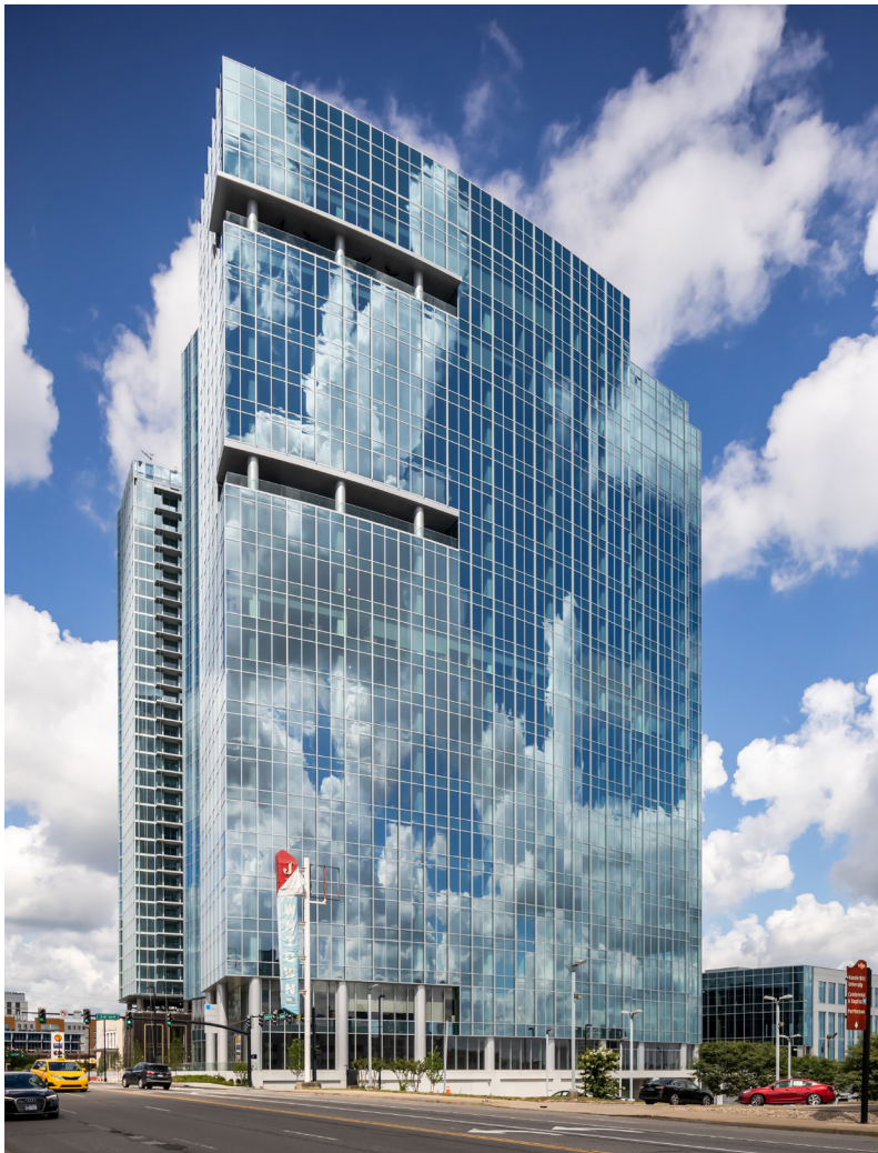
Broadwest Nashville, Tennessee