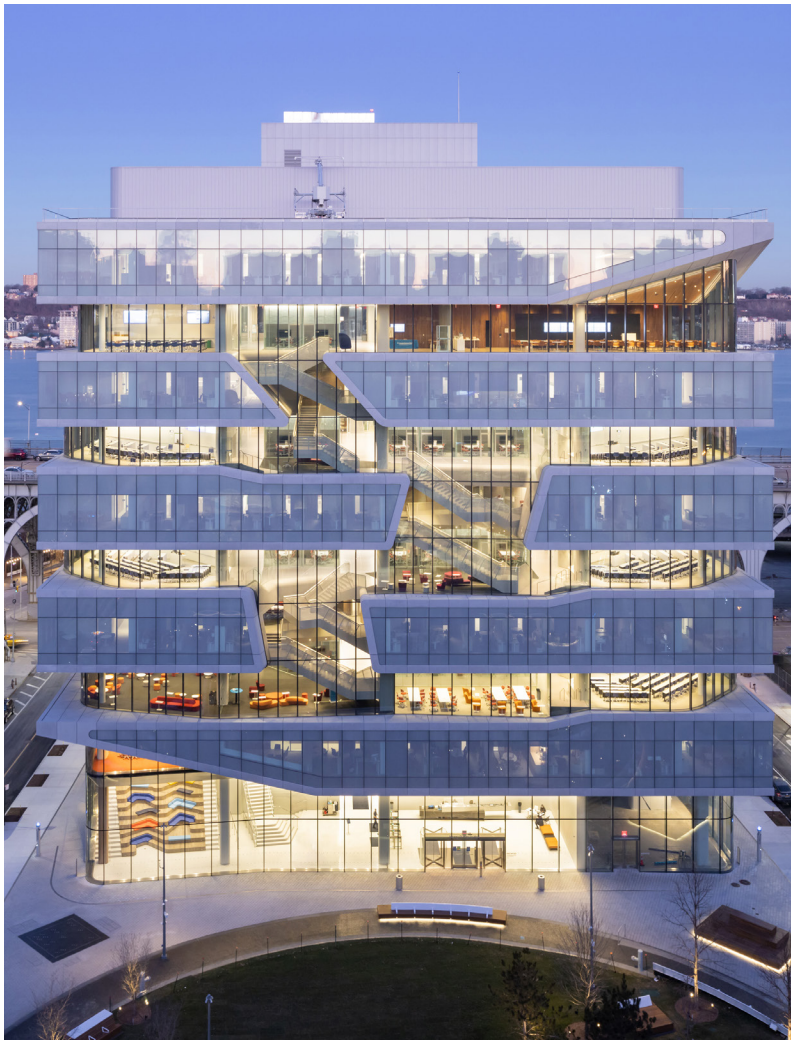
Columbia Business School, Manhattanville Campus, Henry R. Kravis Hall New York, New York