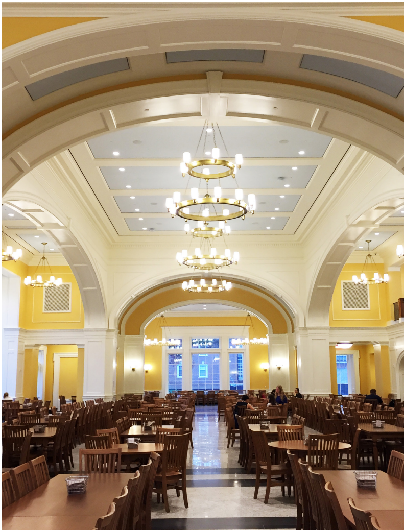
R. David and Suzanne A. Hoover Hall DePauw University, Greencastle, Indiana