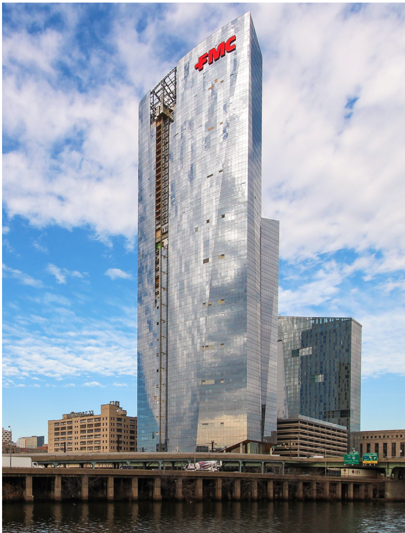
FMC Tower at Cira Centre South Philadelphia, Pennsylvania