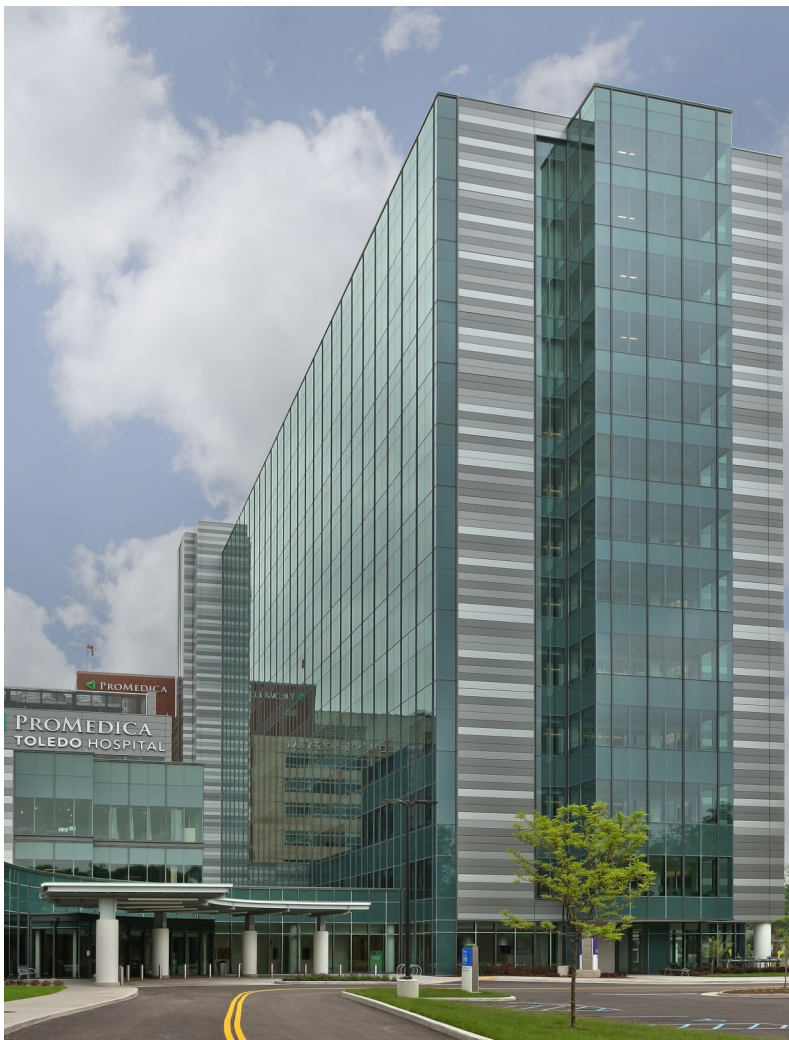
ProMedica Toledo Hospital, Generations of Care Tower Toledo, Ohio