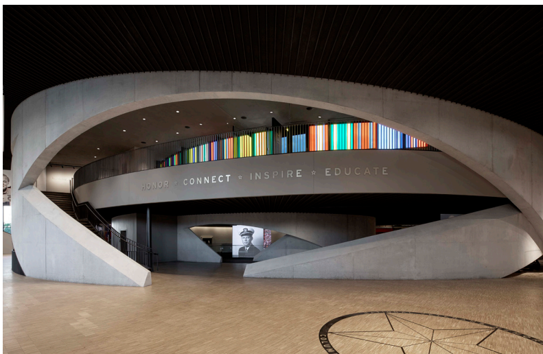
National Veterans Memorial and Museum Columbus, Ohio