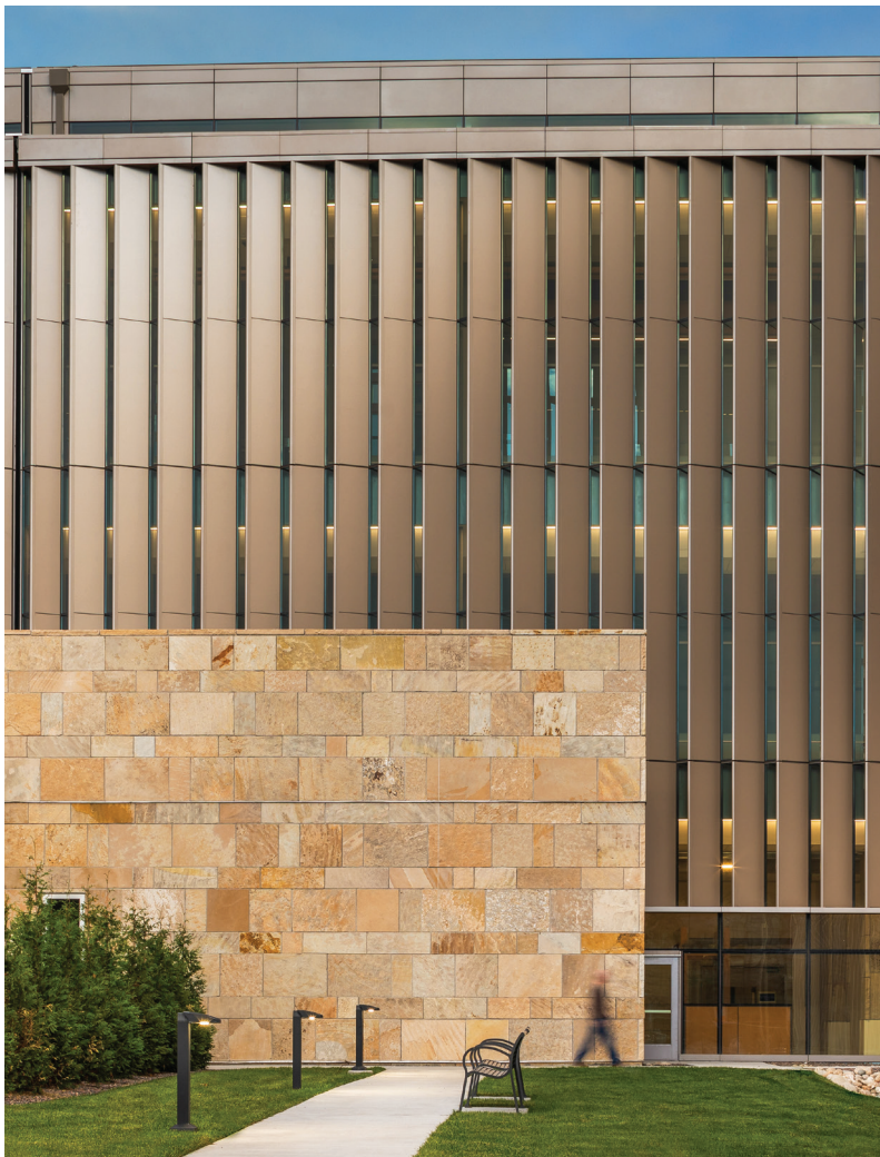
Rocky Mountain Regional Veterans Affairs Medical Center Aurora, Colorado