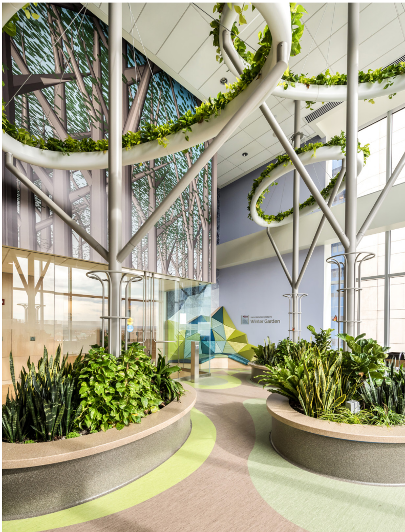
John R. Oishei Children's Hospital Buffalo, New York