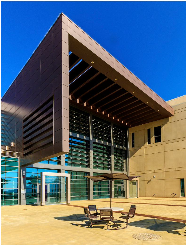
Fort Irwin Weed Army Community Replacement Hospital Fort Irwin, California