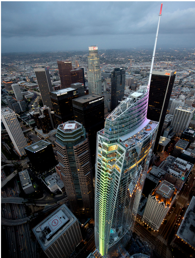
Wilshire Grand Center Los Angeles, California