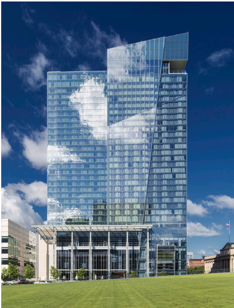
Hilton Cleveland Downtown Cleveland, Ohio