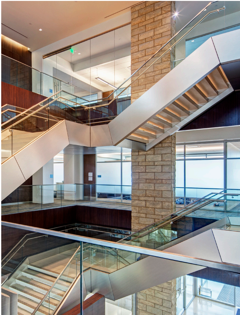
Dallas-Fort Worth Airport, Consolidated Headquarters Dallas-Fort Worth, Texas