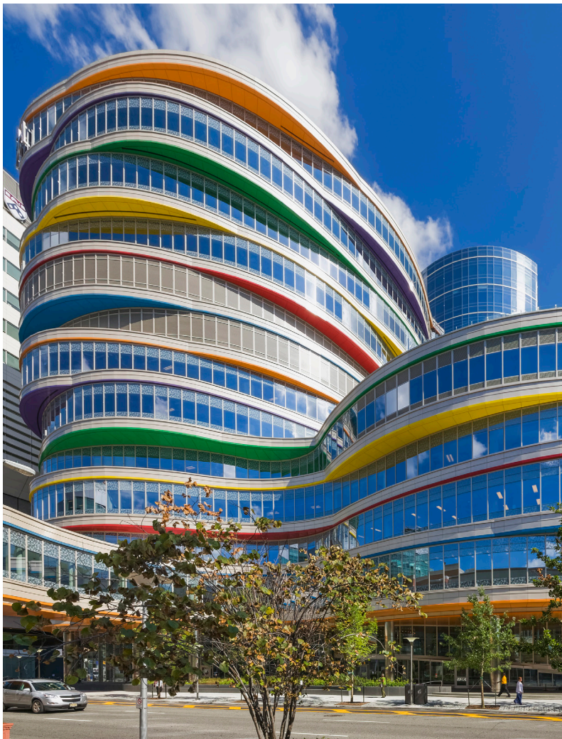
Children's Hospital of Philadelphia, Buerger Center for Advanced Pediatric Care Philadelphia, Pennsylvania