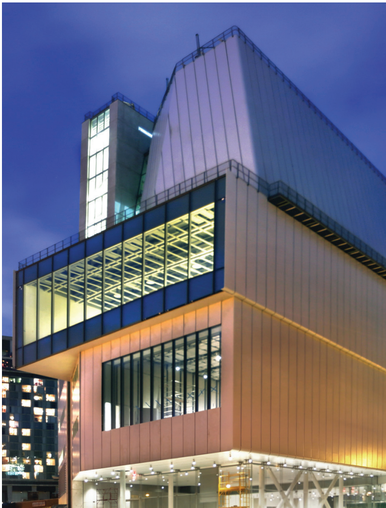
The Whitney Museum of American Art New York, New York