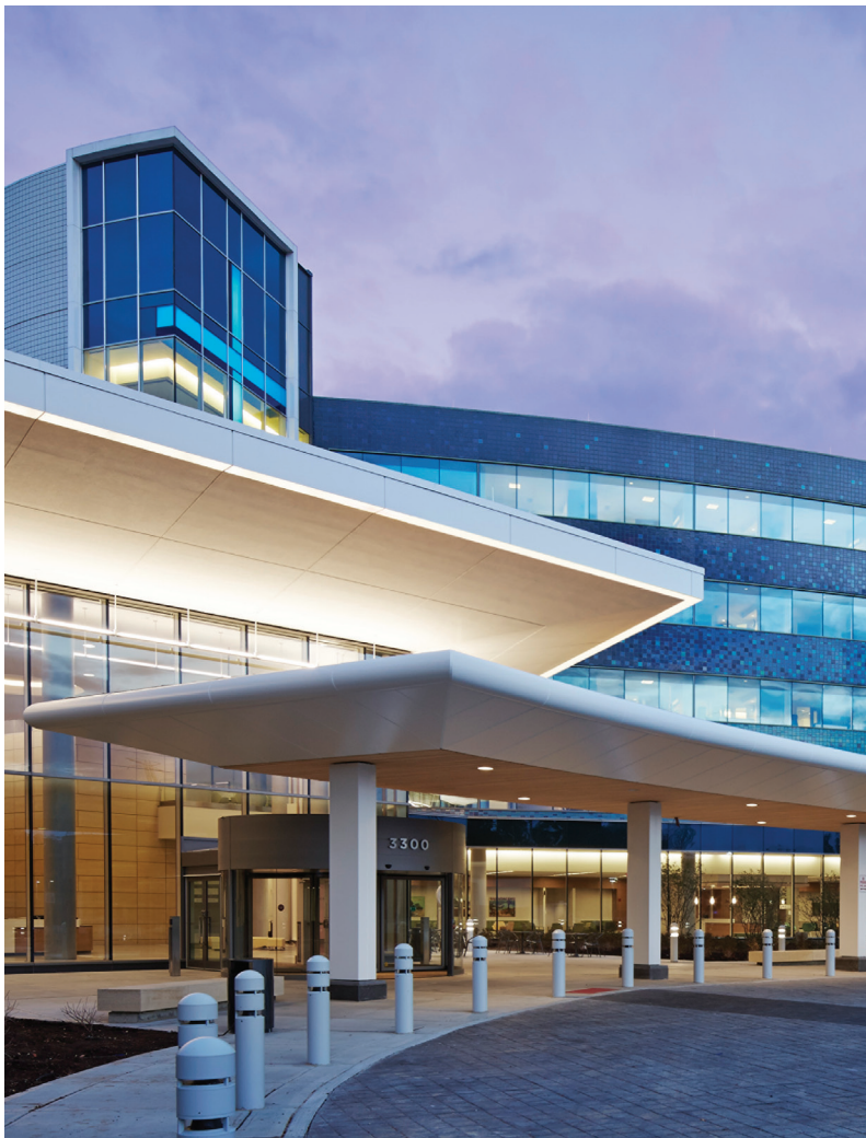
Mercy Health - West Hospital Cincinnati, Ohio - ENR Midwest Best Healthcare Project of 2014