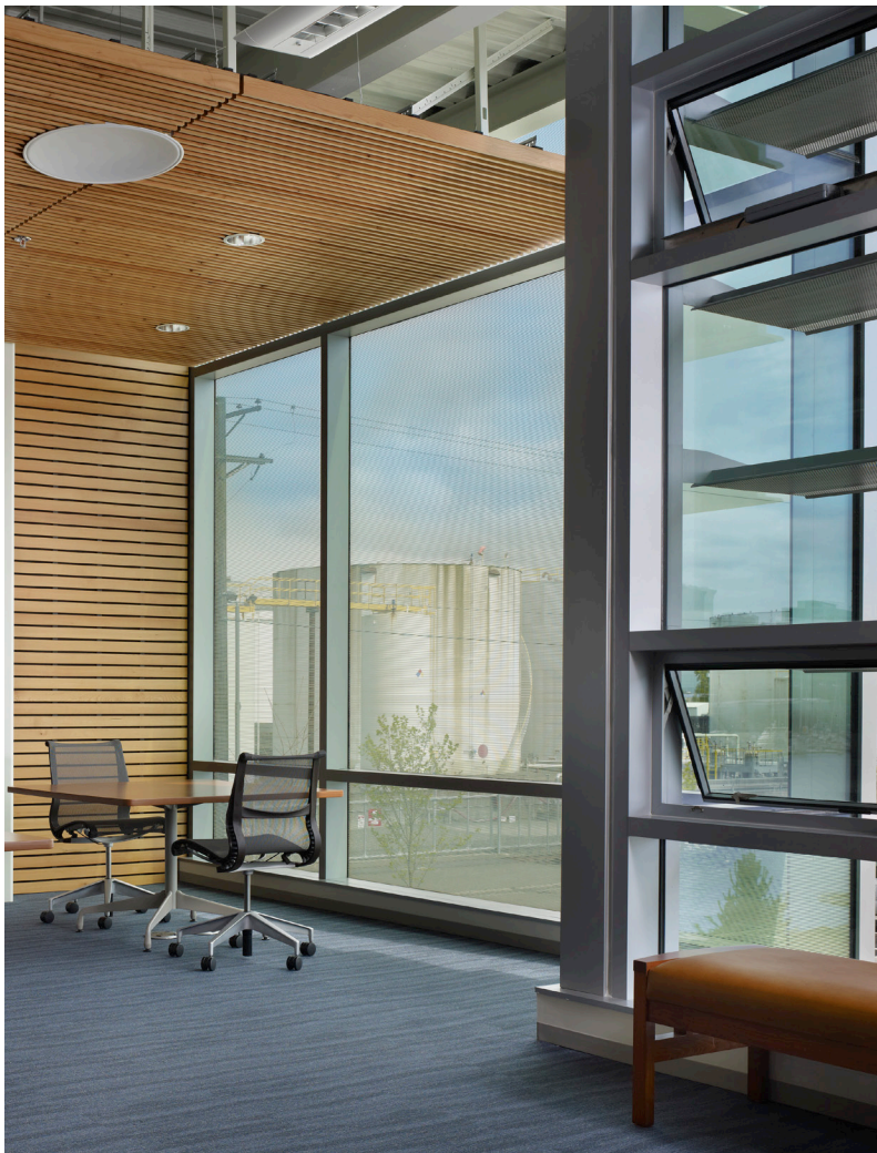
Urban Waters Tacoma, Washington