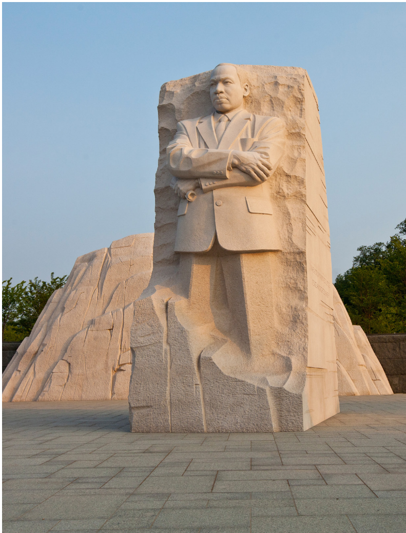
Martin Luther King Jr. National Memorial Washington, DC